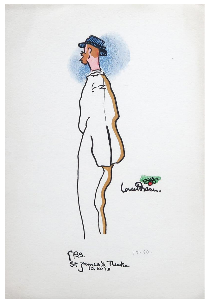
Claud Lovat Fraser (1890–1921), A Caricature of George Bernard Shaw, 1912.